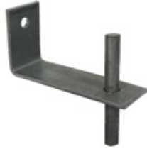
'L' Anchor w/ Dowel