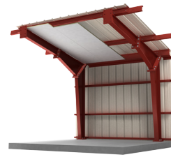
Engineered Metal Building Ceiling