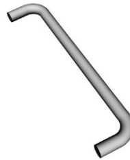
'U' Anchor Rod